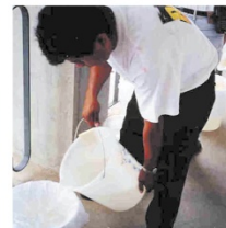
Decanting the Water through a Cloth Filter