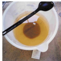
Floc Formation after P&G Packet Addition