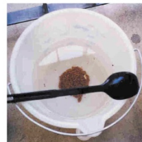
Floc Formation after Complete Stirring