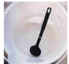
Clean Water Ready for Storage and Use